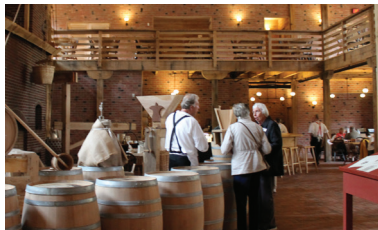
Carillon Historical Park Brewery