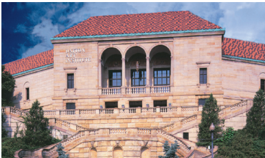
Dayton Art Institute