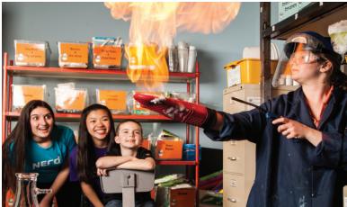
Boonshoft Museum of Discovery