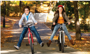
Nation's Largest Network of Paved Trails—340+ miles