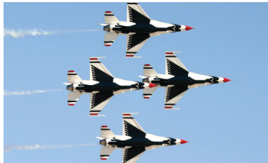
2018 Vectren Dayton Air Show—June 23-24