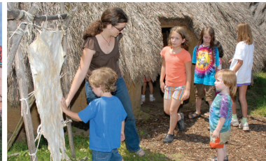
SunWatch Indian Village/Archaeological Park