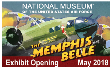
The Memphis Belle Exhibit—May 2018

Download your Wilbear Passport at daytoncvb.com .