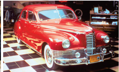
America's Packard Museum