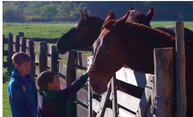
Horseback Riding at Carriage Hill Farm