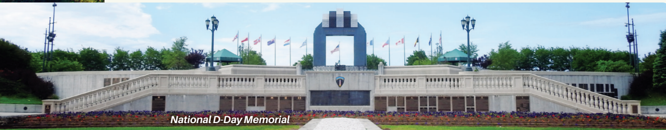
National D-Day Memorial