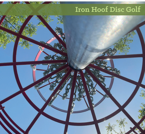
Iron Hoof Disc Golf