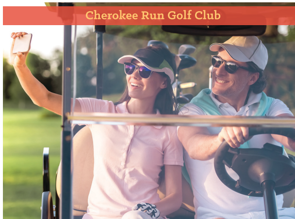
Cherokee Run Golf Club