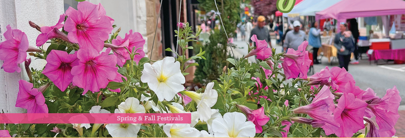
Spring & Fall Festivals

DESTINATION DINING, SHOPPING, EVENTS, RECREATION & MORE. 30 MINUTES EAST OF ATLANTA. CALL 1-800-CONYERS TO REQUEST YOUR VISITORS GUIDE, OR DOWNLOAD AT VISITCONYERSGA.COM