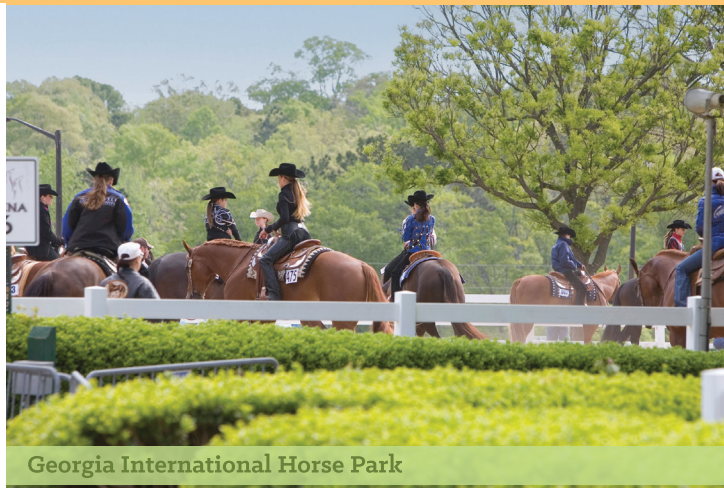
Georgia International Horse Park