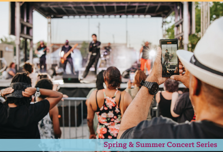
Spring & Summer Concert Series

DESTINATION DINING, SHOPPING, EVENTS, RECREATION & MORE. 30 MINUTES EAST OF ATLANTA. CALL 1-800-CONYERS TO REQUEST YOUR VISITORS GUIDE, OR DOWNLOAD AT VISITCONYERSGA.COM