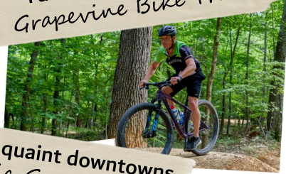
Tune in to quaint downtowns. Historic Greenville